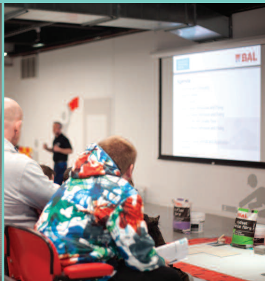
Auditorium At the heart of the facility is the interactive 160 m auditorium for demonstrations and practical hands-on training.