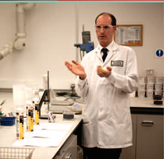
Understand our Technology As part of your experience, you will enjoy a factory tour and visit our R&D and Quality Laboratories