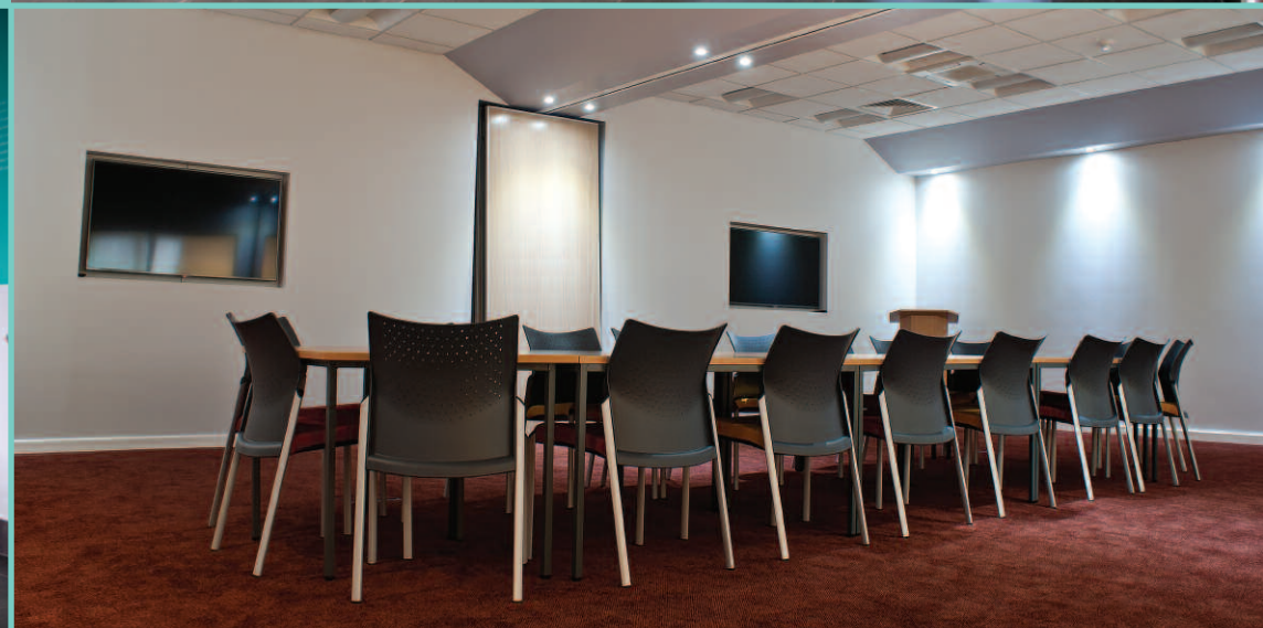
Meeting Rooms State-of-the-art meeting rooms for presentations, CPDs and conferences.