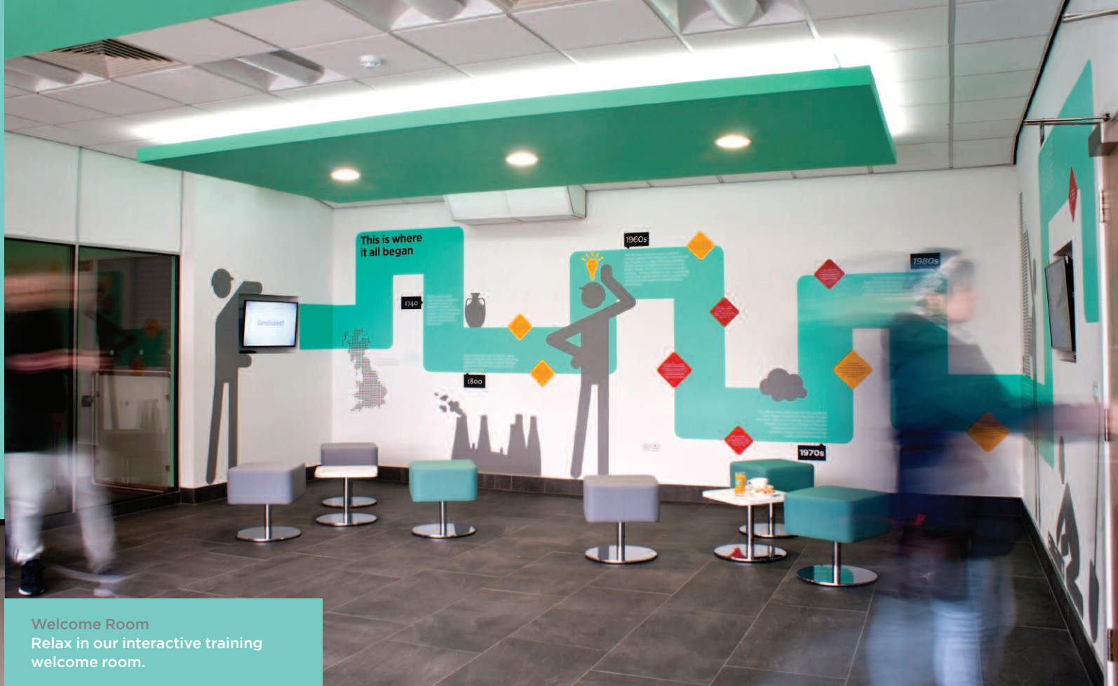
Welcome Room Relax in our interactive training welcome room.