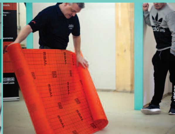
Practical Training Room Enjoy further hands-on training within our training bays.