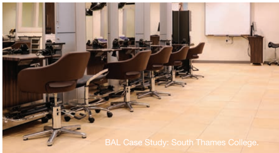
BAL Case Study: South Thames College.