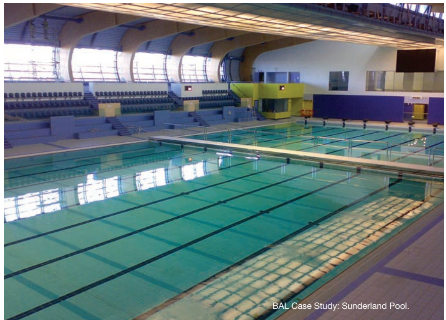
BAL Case Study: Sunderland Pool.