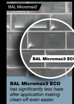
BAL Micromax3 ECO has significantly less haze after application making clean-off even easier.